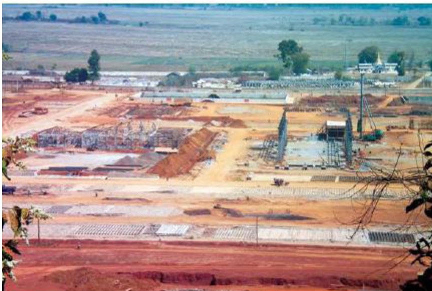
Looking east from the construction site of the iron factory. The pagoda in the upper right corner lies just outside the double wall around the factory. Photo taken in February 2009