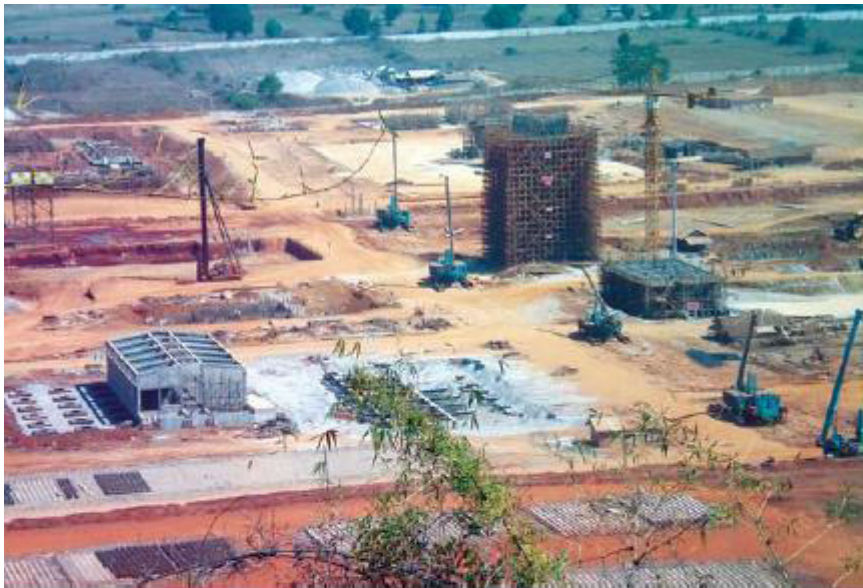
Pinpet iron factory under construction in February 2009