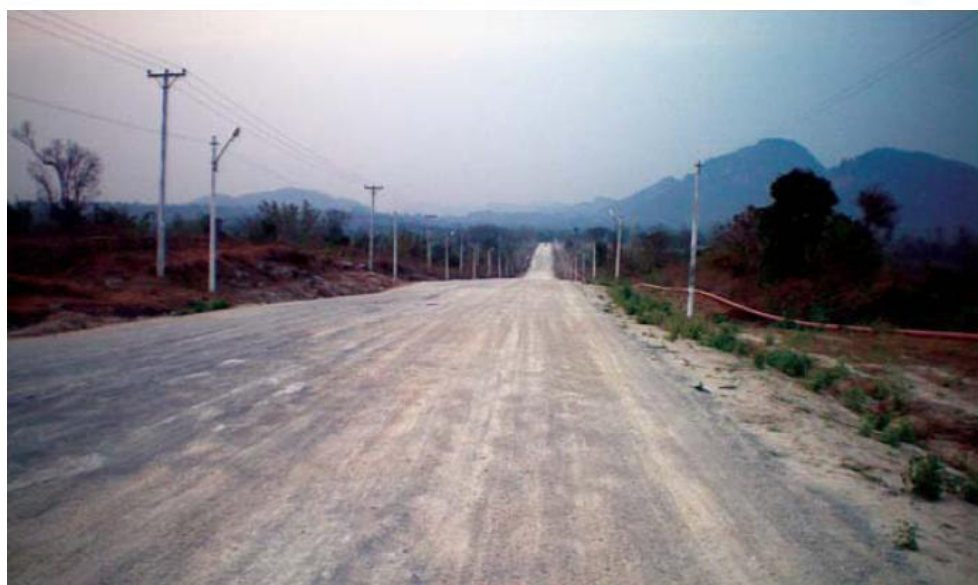
Farm lands were confiscated for construction of this road from Mount Pinpet to Taunggyi. The red gas pipeline is to the right of the road.