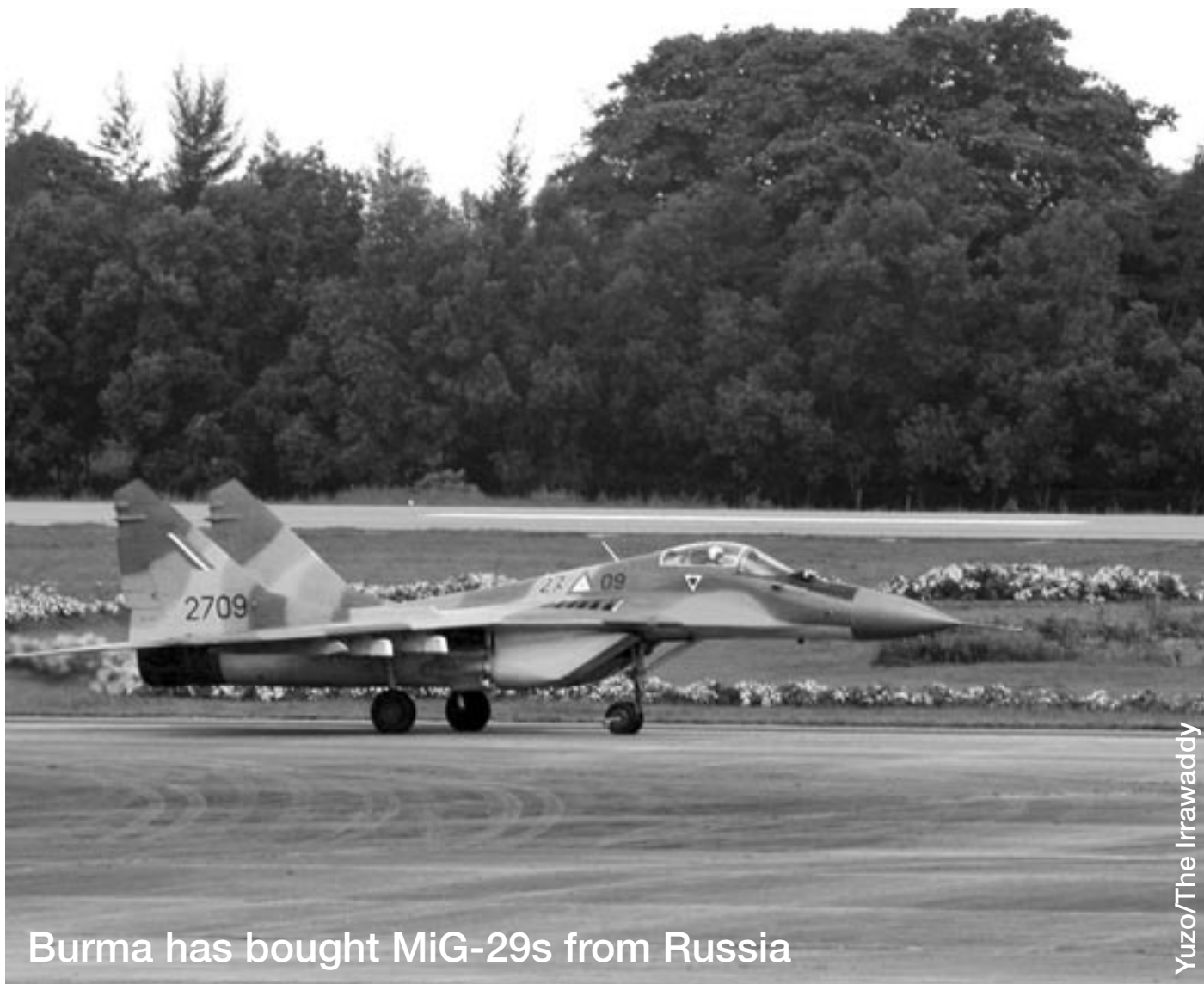
Burma has bought MiG-29s from Russia