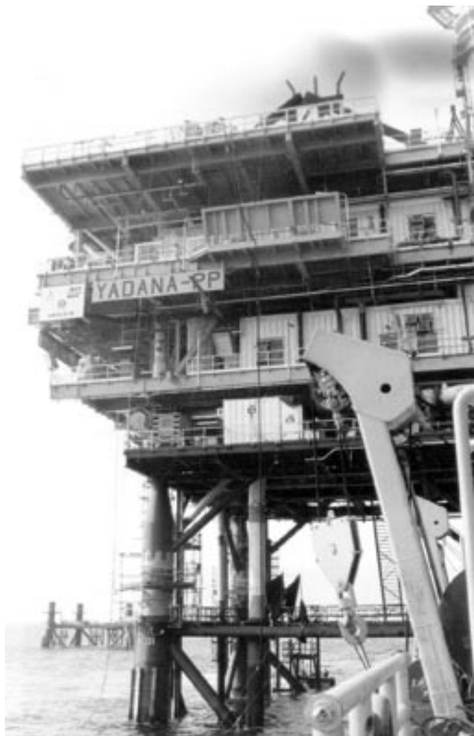
One of TOTAL's gas rigs in Burma.

TOTAL's presence in Burma continues to influence French foreign policy, which in turn has affected the foreign policy of the EU as a whole towards Burma. The effect has been a weaker EU Common Position towards Burma's military dictatorship. It is likely that the French government will block UN Security Council and EU action on Burma for as long as TOTAL remains in the country.