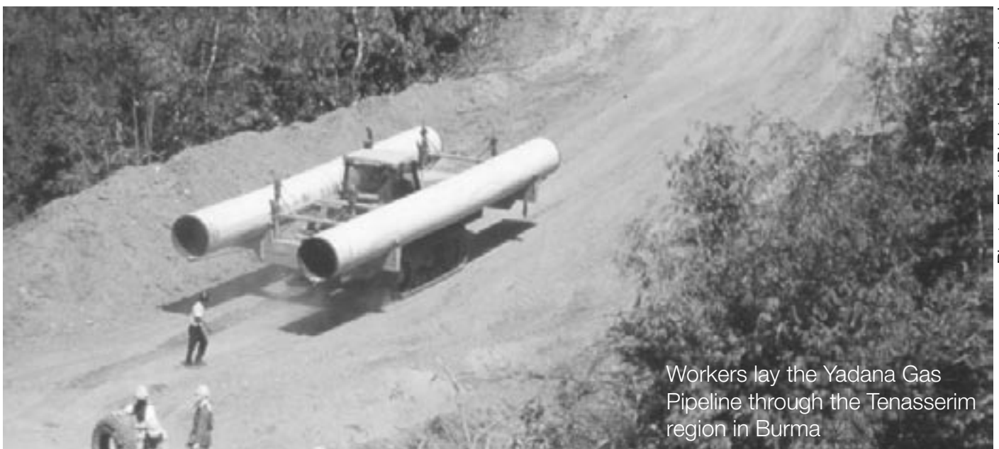
Workers lay the Yadana Gas Pipeline through the Tenasserim region in Burma