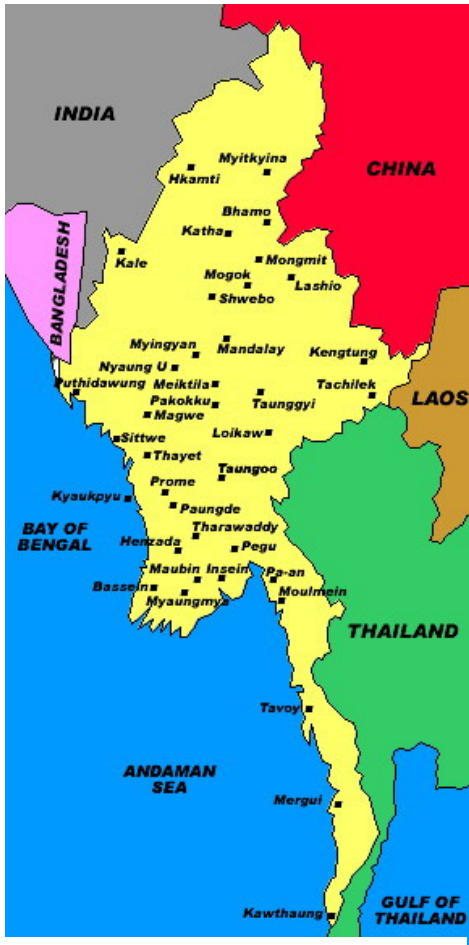
Map of prisons in Burma

One of the major concerns for Burma's political prisoners right now is the impact of prison transfers. The medium to long-term effect of prison transfers on political prisoners' health is likely to be very serious, and may directly result in more deaths in prisons.